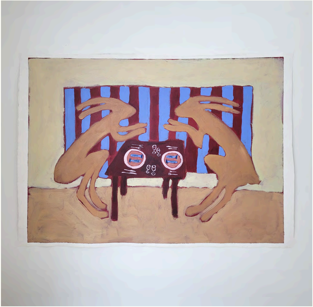
Hot Takes & Wine 2024