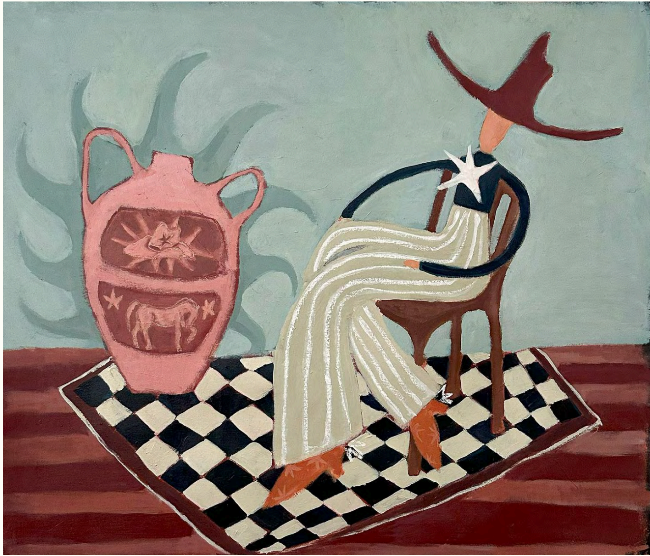
Desert Discs 2025