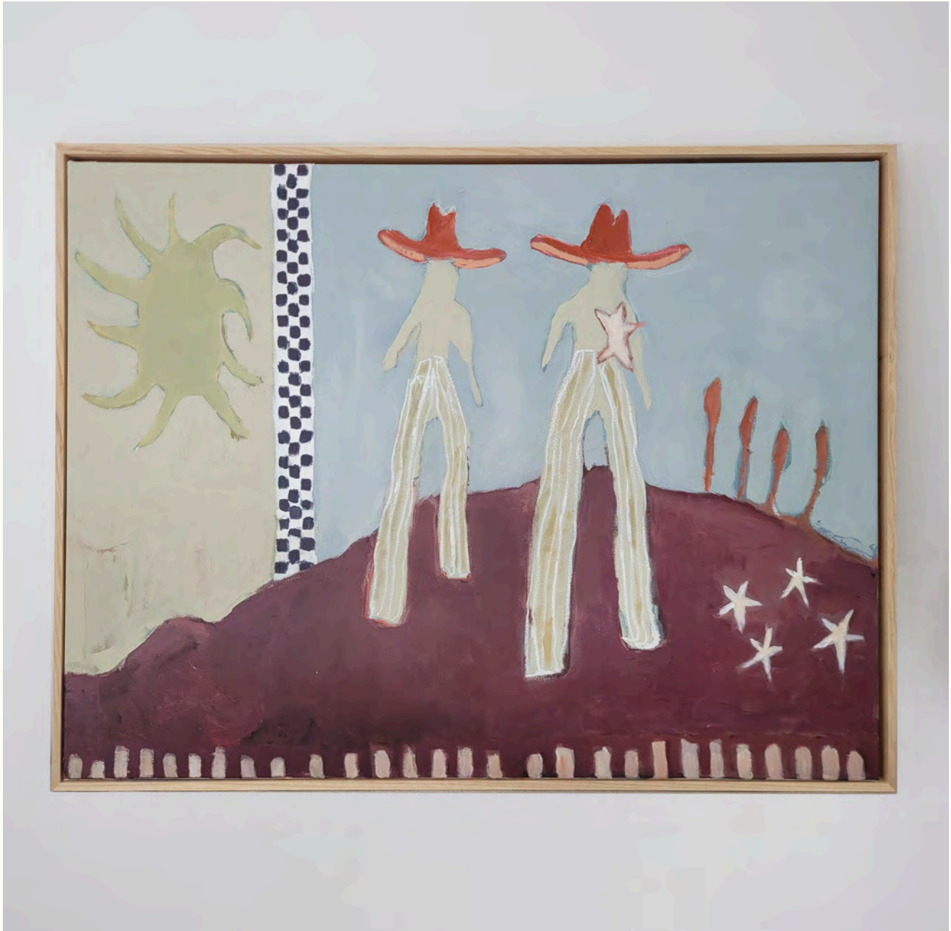
Morning Patrol 2024