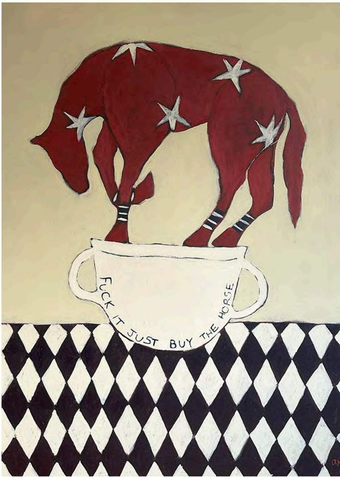
Unbridled Freedom 2 2025