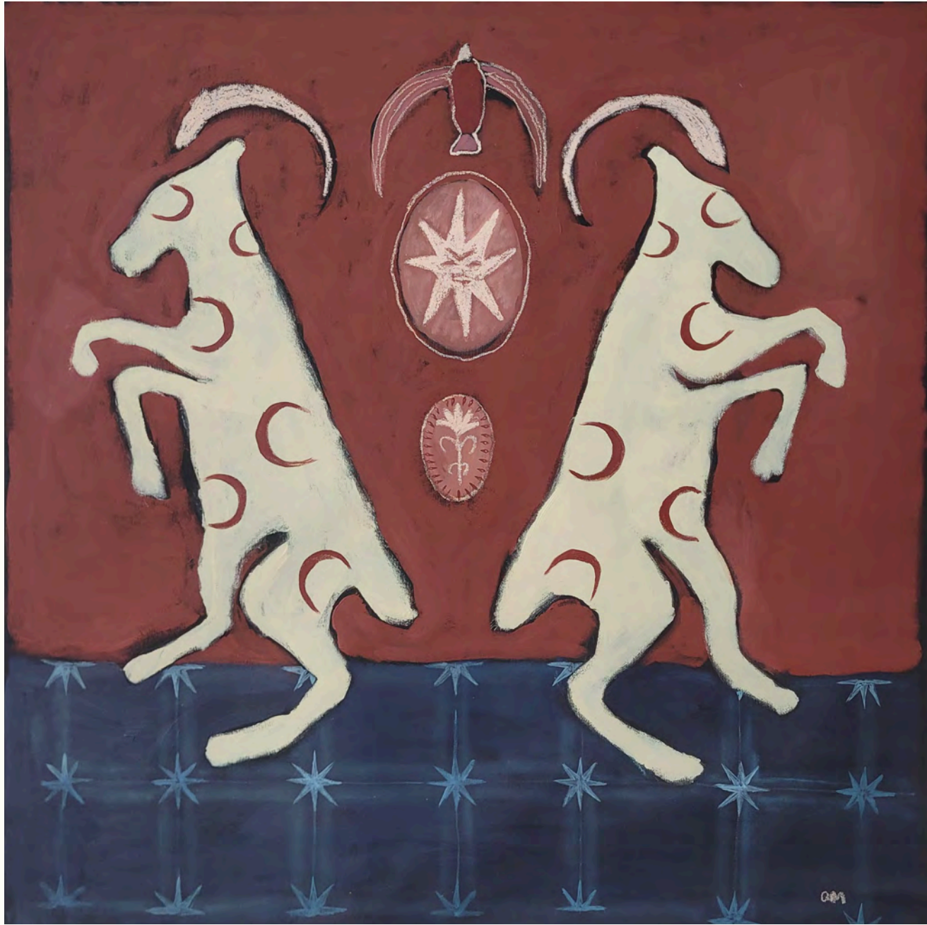
Aries in Arms 2024