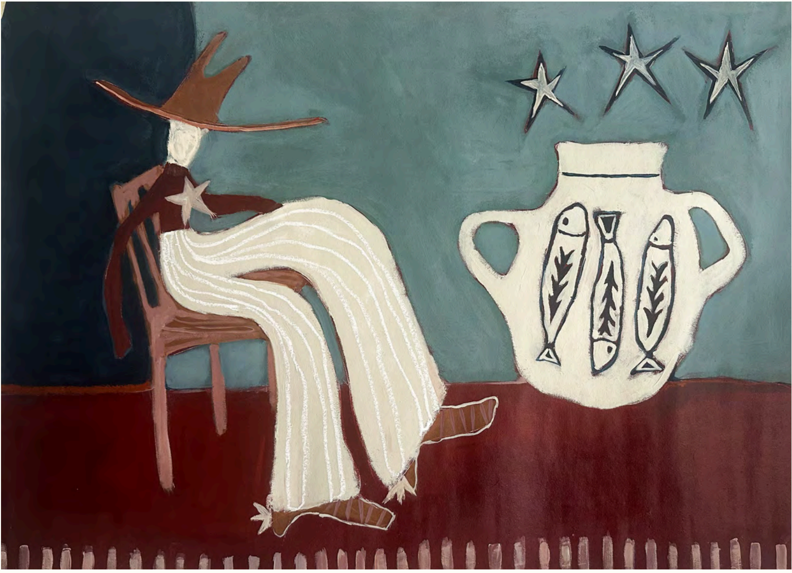
Moonlight Ceviche 2025