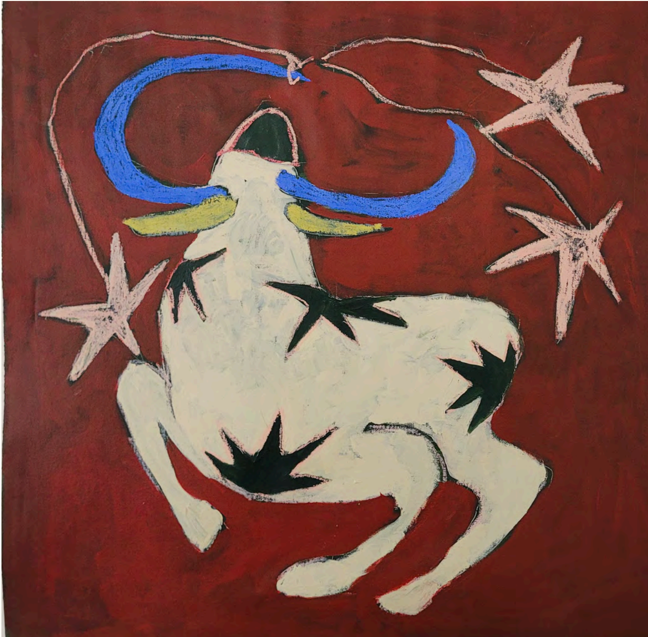
Taurus Nights 2024