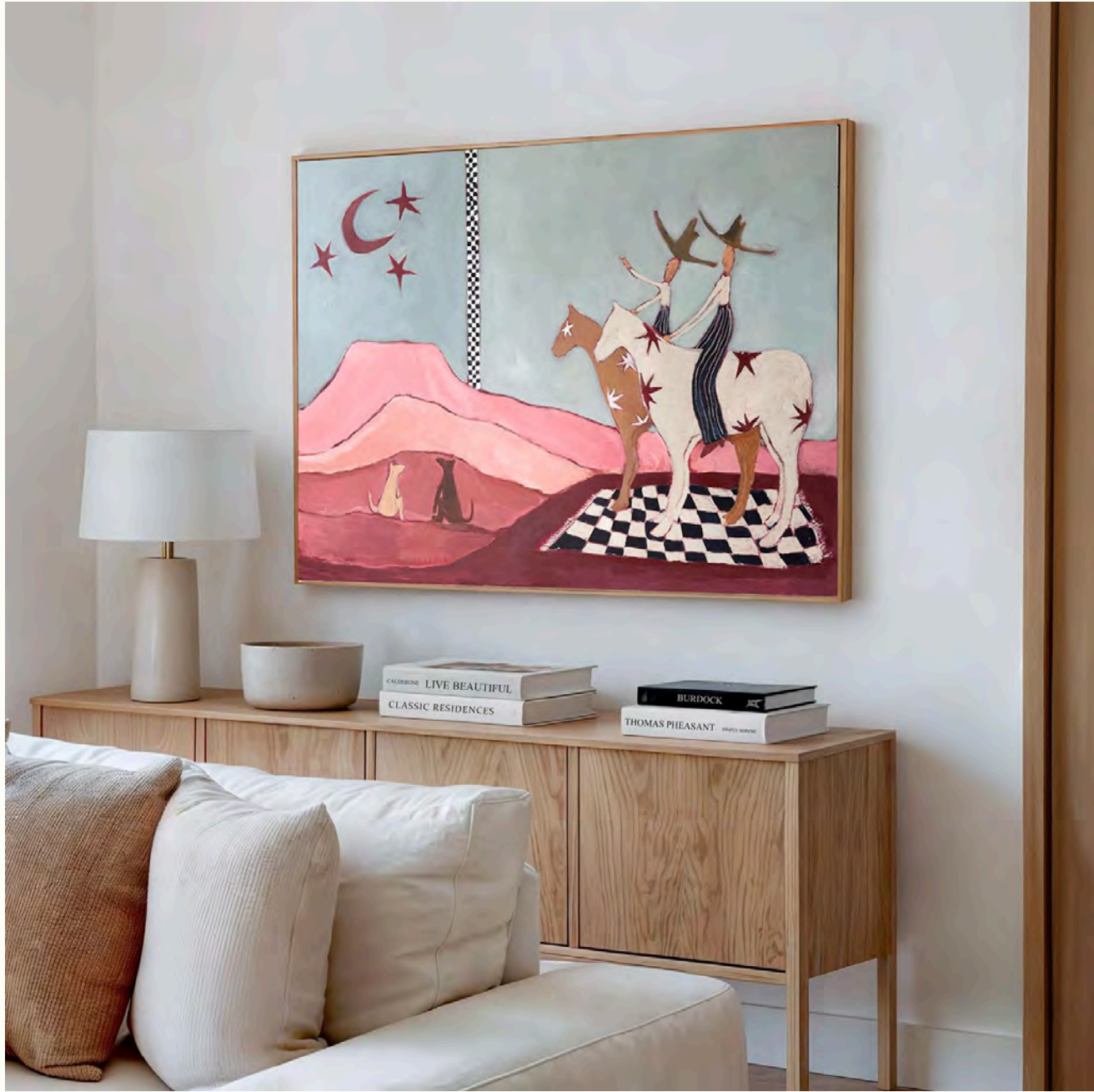
Forever Westward 2025