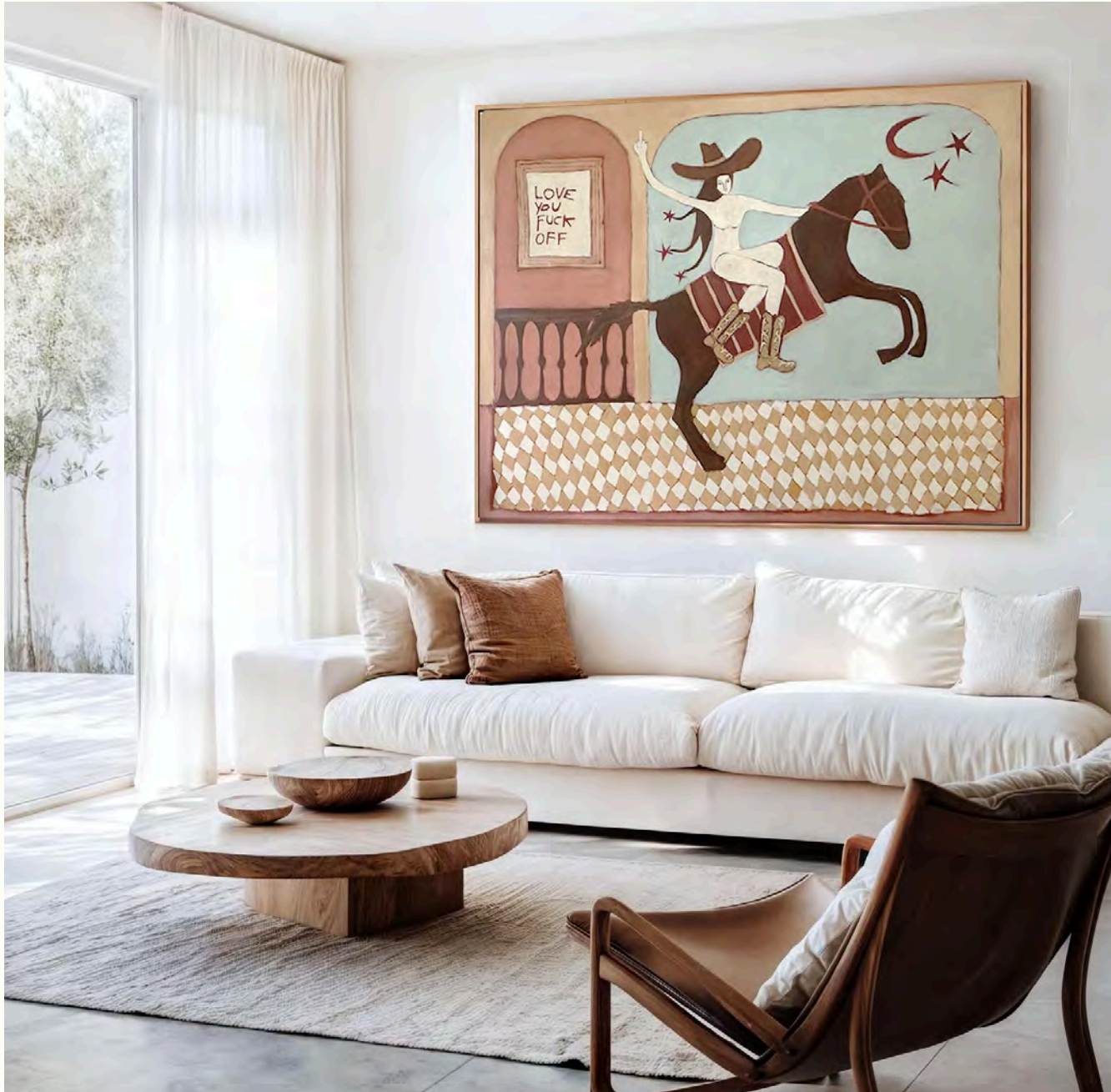
Love You, F**k Off 2025