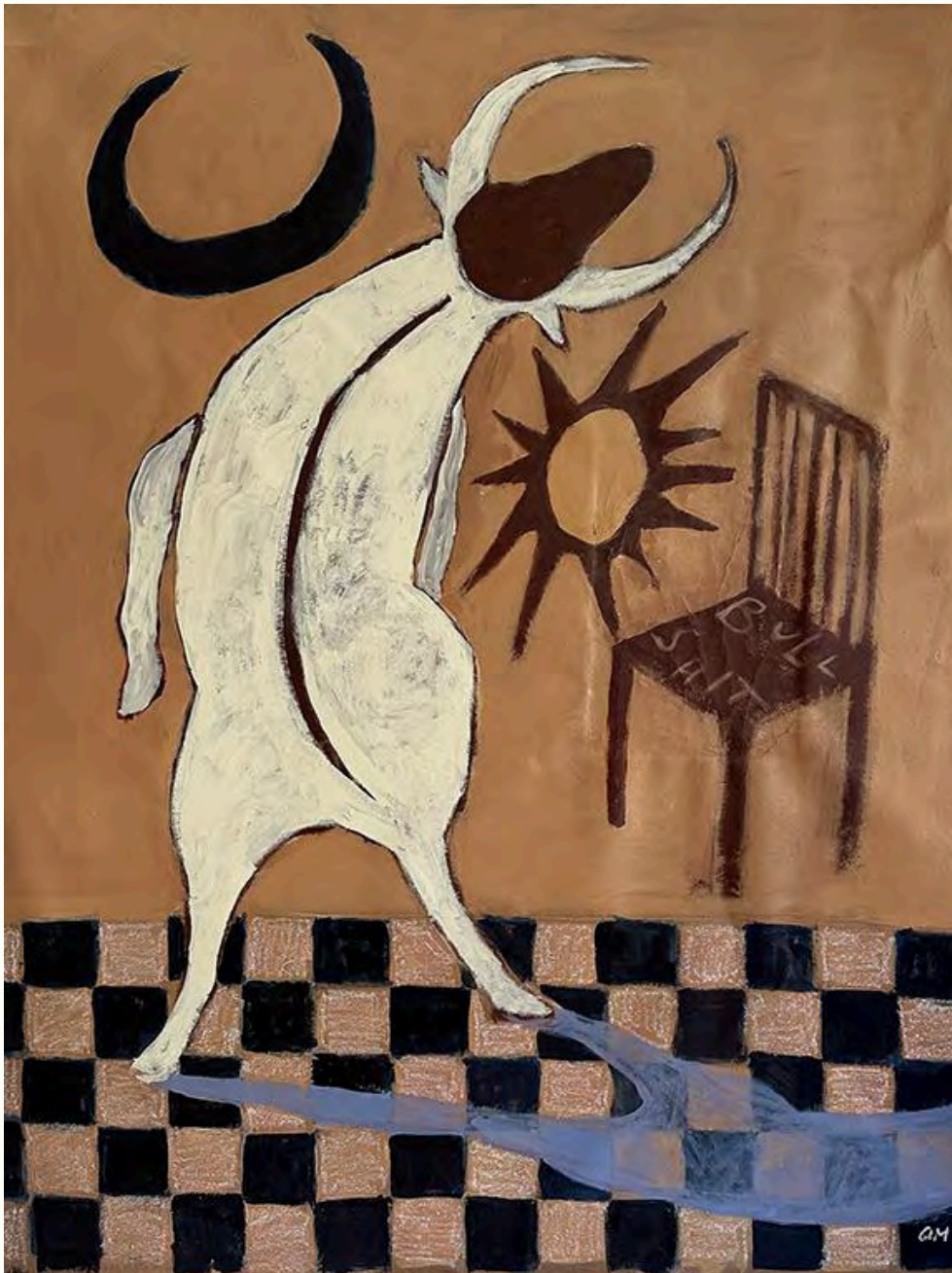
Calling Bullshit 2025