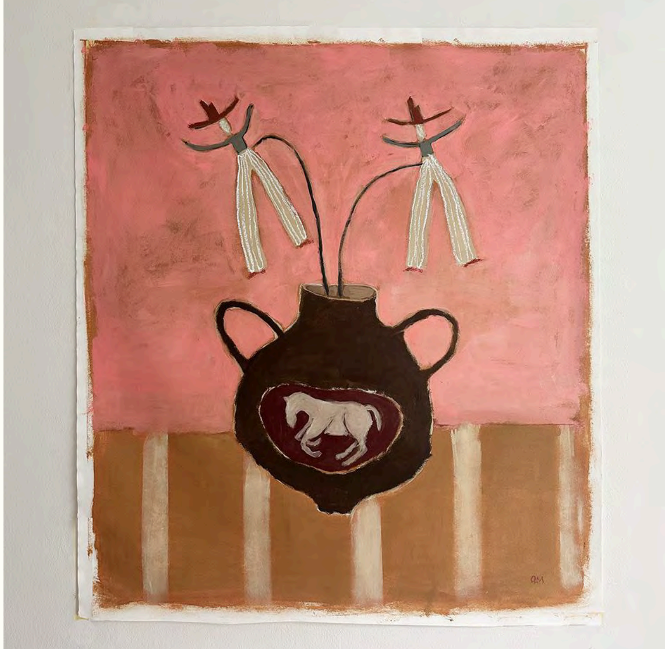
Western Bloom 2025