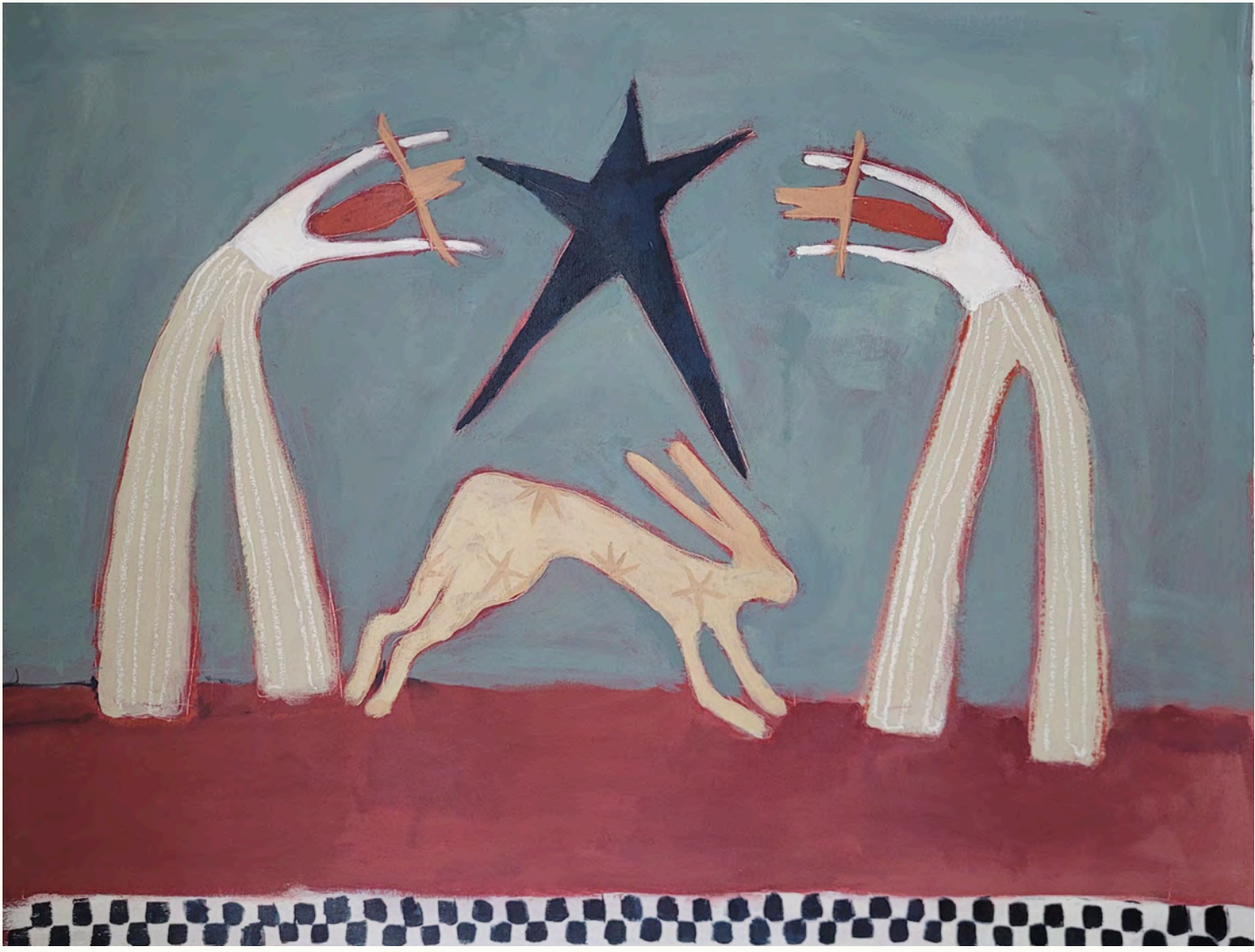
Morning Yoga 2024