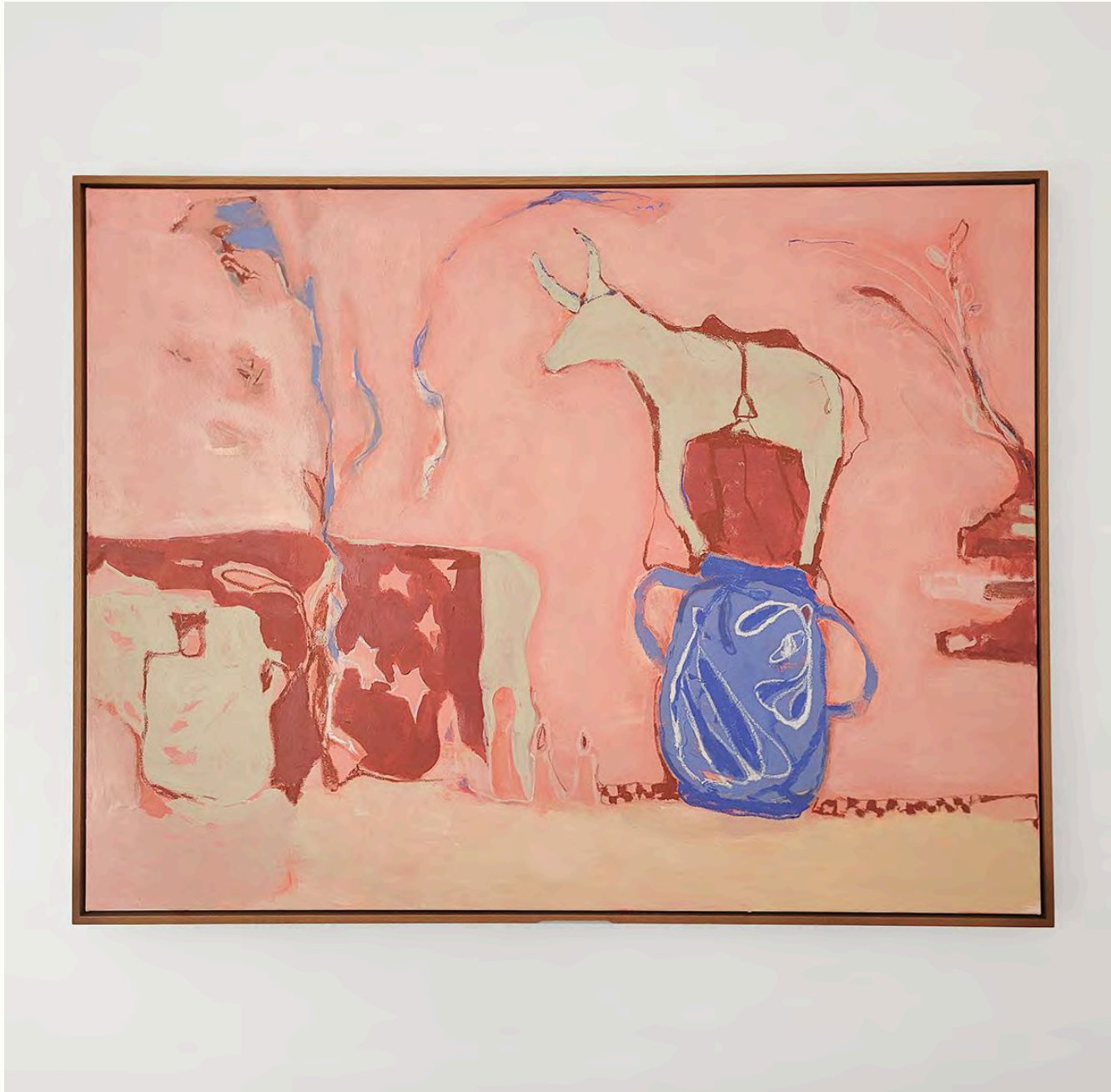
June in Marrakech 2024