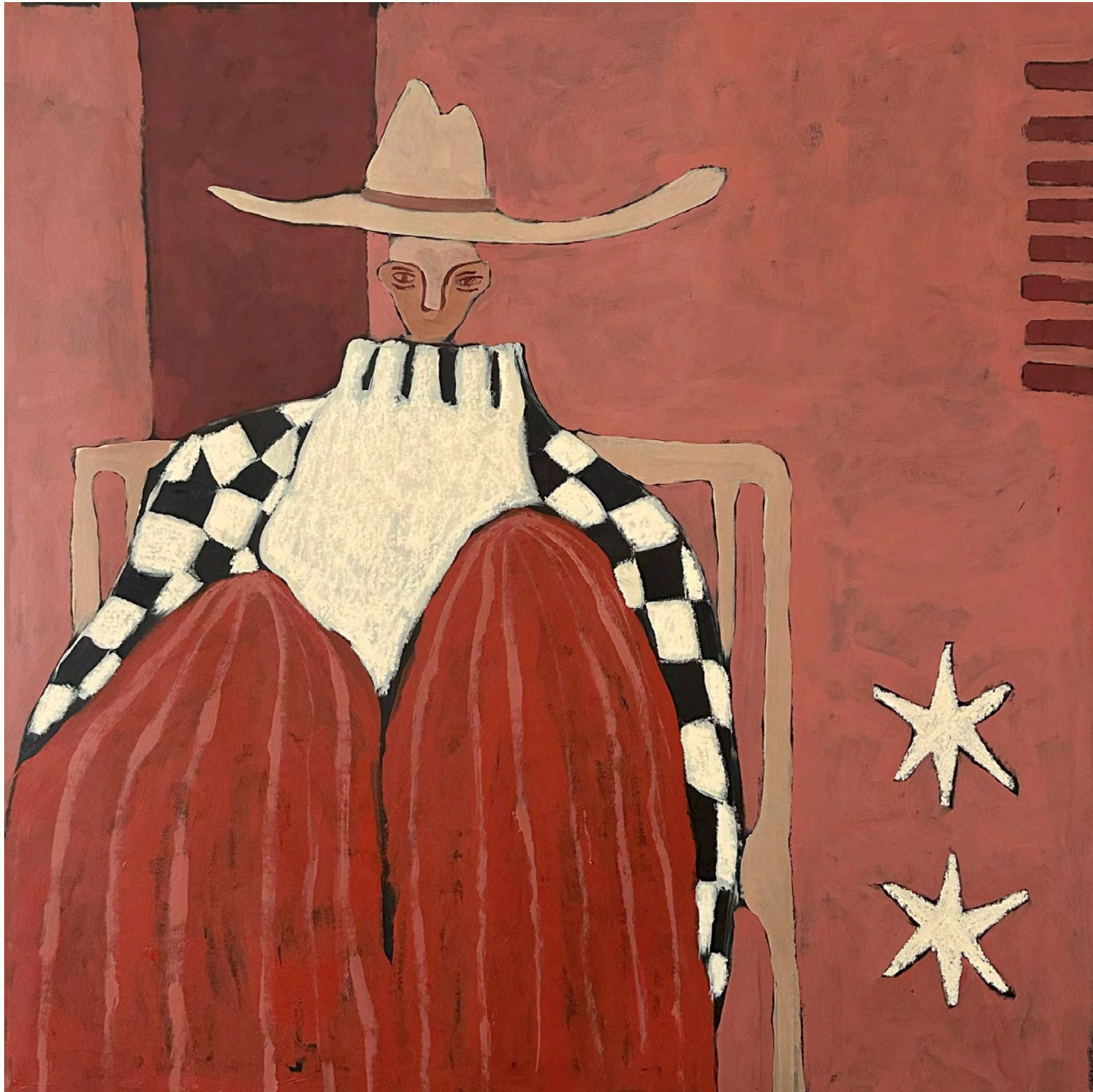
A Quiet Place 2025