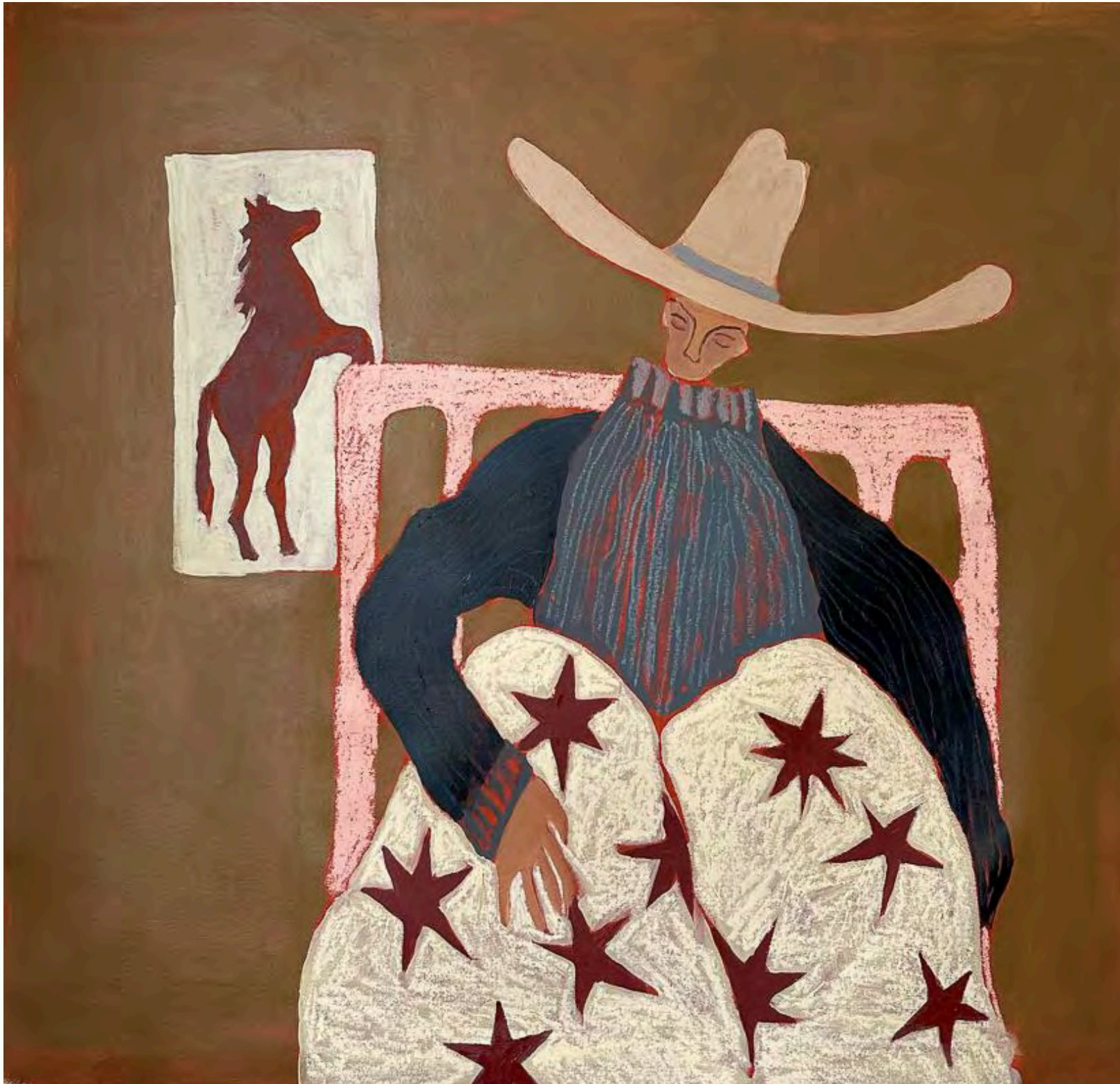
A Cowboy's Dream 2025