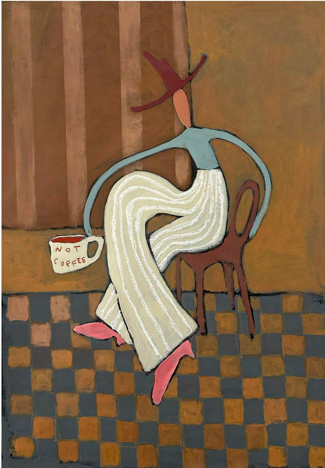
It's 5 O'Clock Somewhere 2025