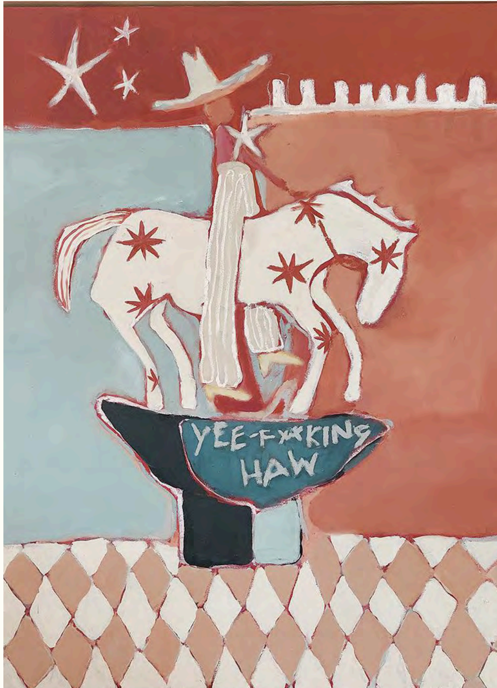
Yee F**king Haw 2024