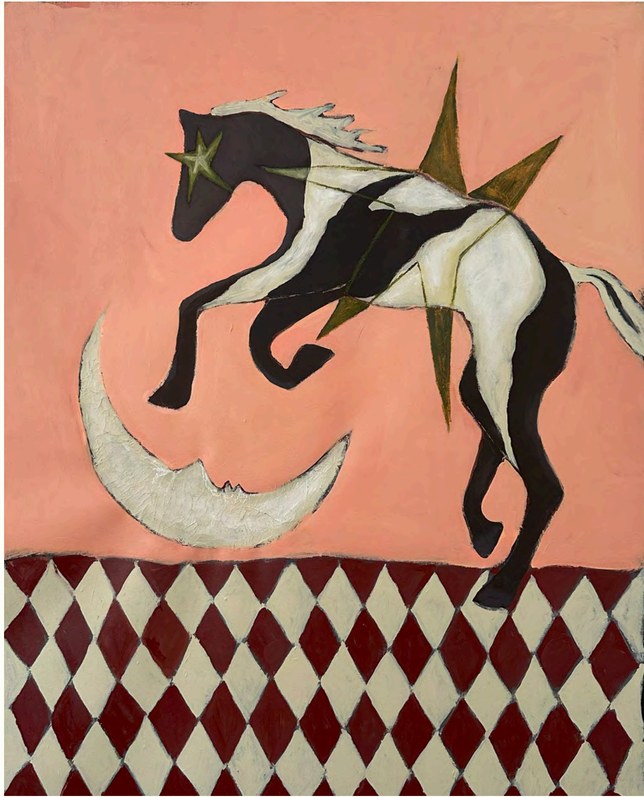
Too the Moon 2025