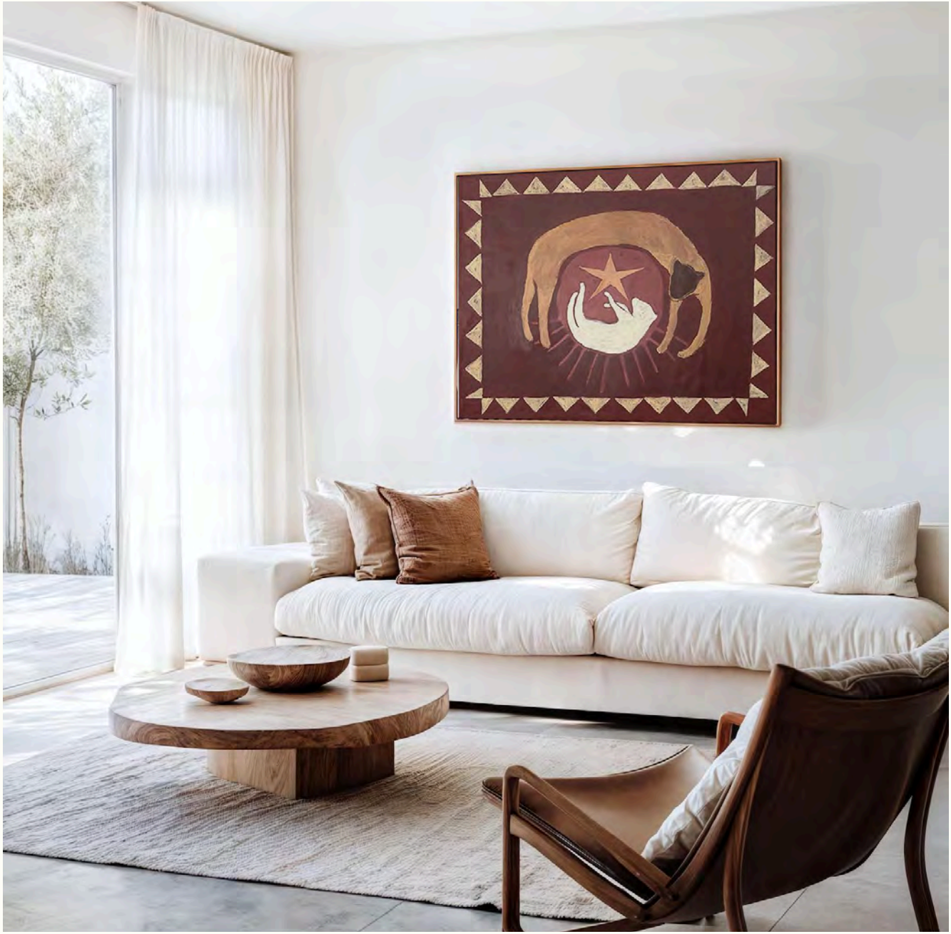
Mother & Cub 2024