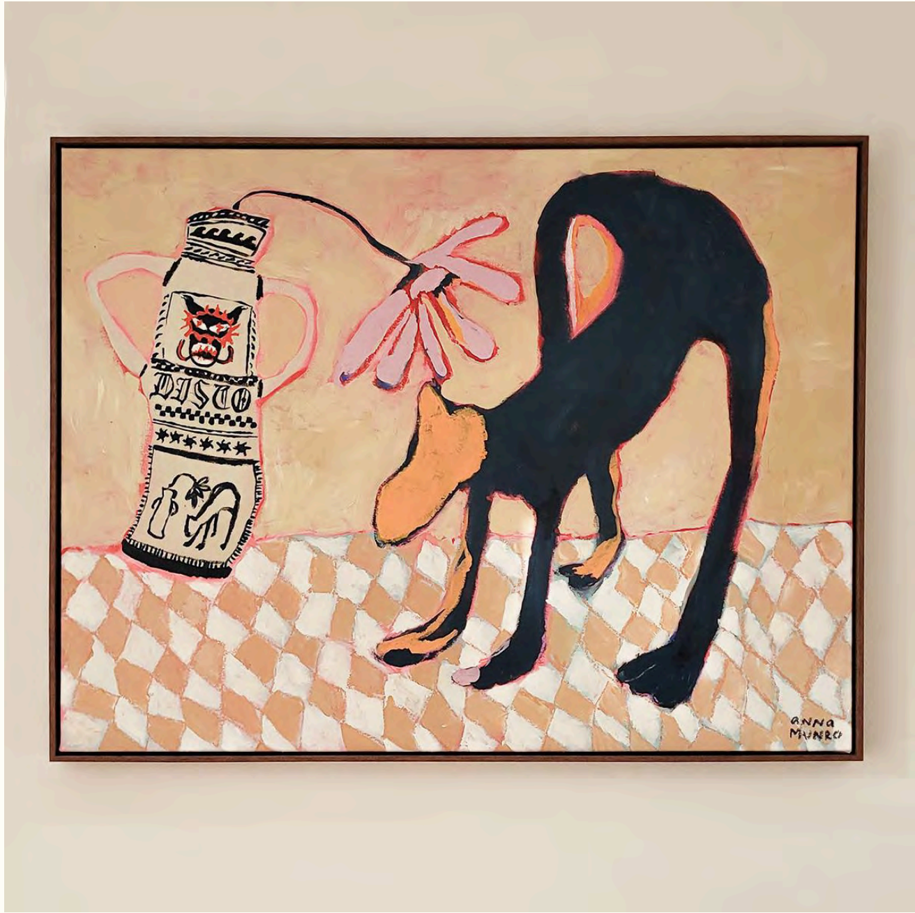
Disco Baby 2024