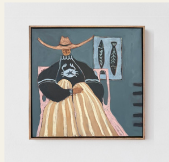
Canvas stretched + float frame