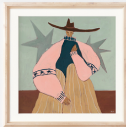
Framed with mount