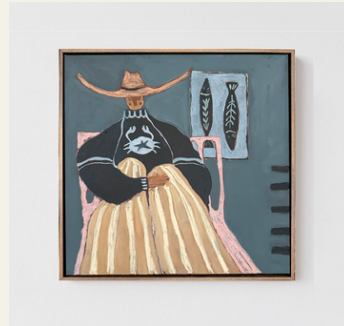
Canvas stretched + float frame